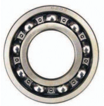
for illustration only